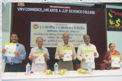
Inauguration of VMV Bulletin