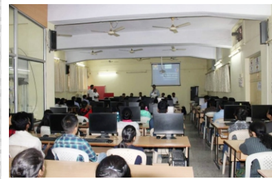
Google Crowdsourcing Event