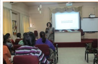
7th Days Skill Enhancement Programme